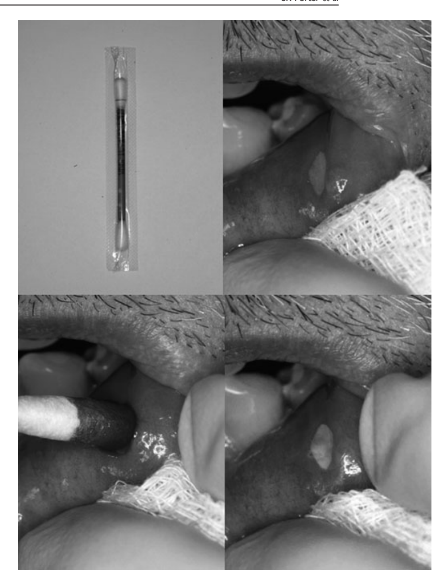
Figure 2 The cotton wool device contains the active solution that is delivered via placing the tip of the swab upon an ulcer for 10 s. The outcome of application of HybenX creates a protective layer of coagulated tissue debris over the surface of the ulcer

undertaken. However, it is probable that early application may hasten the reduction in pain associated with this type of ulceration.