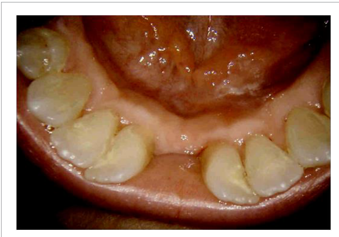
Figure 3: Marked reduction of the aphthous ulcers after one week since the first application.

The active principle of Oralmedic® utilizes the same technology commercialized for the non-surgical treatment of the dental plaque (HybenX*): it is a desiccant liquid and its application to plaque biofilm instantly causes rapid absorption of water (strong hygroscopic properties), which leads to the precipitation and collapse of organic material. The Oralmedic® solution comprises a concentrated aqueous mixture of free sulphate and sulphonated aromatics, specifically hydroxybenzenesulphonic acid, hydroxymethoxybenzene suphonic acid and suphuric acid. The hydrozybenzenes are keratolytic, whereas the sulphonate groups and sulphuric acid are hygrposcopic and denaturing. The use of Oralmedic® in the treatment of aphtae was first reported by Porter et al. [12]. They examined the potential benefits of HybenX in a prospective randomized trial. Their results revealed that when compared with a device designed to protect areas of oral ulceration, local application of HybenX significantly reduced the pain of RAS after 2 days. Both HybenX and the control device caused a reduction in unchallenged pain scores between days 1 and 4, but the reduction by HybenX was always greater than that of the control device. Denaturation, precipitation and coagulation of the tissue debris on the aphthous ulcer surface and the creation of a protective layer of